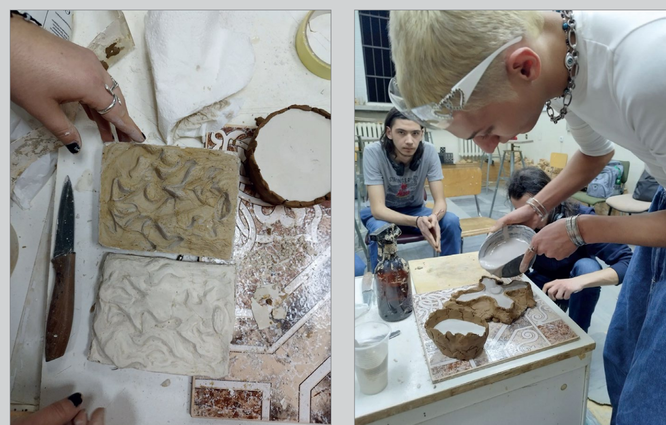
Photos from "Open Art Sculpture Studio and Workshop" in the sculpture studio of Faculty of Educational Studies and the Arts, Sofia University "St. Kliment Ohridski" on March 18th 2024