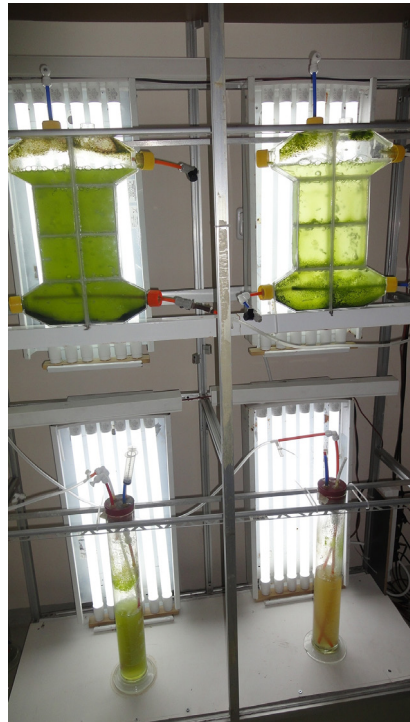
Figure 2. PBRs in inoculum (bellow) and production stage (above)